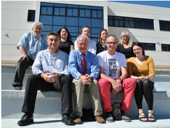
The project team at the 4 th partner meeting

After two years of successful pan-European cooperation the StepIn! Project is coming to an end. From January 2012 to December 2013, the project team has jointly worked for inclusive societies and an active participation of migrants and minorities in Europe. The project partners from seven European countries – Germany, Italy, Scotland (GB), Slovenia, Sweden, the Czech Republic and Cyprus – have exchanged experiences and commonly developed training modules for adult education professionals. These have been tested in national workshops and a European training and published in a handbook.