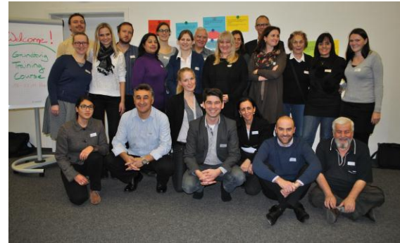
The Grundtvig Training Course in Hannover

Die Grundtvig Training Course “Promoting social inclusion by fostering migrants’ active citizenship and intercultural competences of adult education professionals” took place from November 18 th to 22 nd , 2013 in Hannover, Germany. Experts coming from the seven partner countries of the StepIn! Project participated in the seminar.